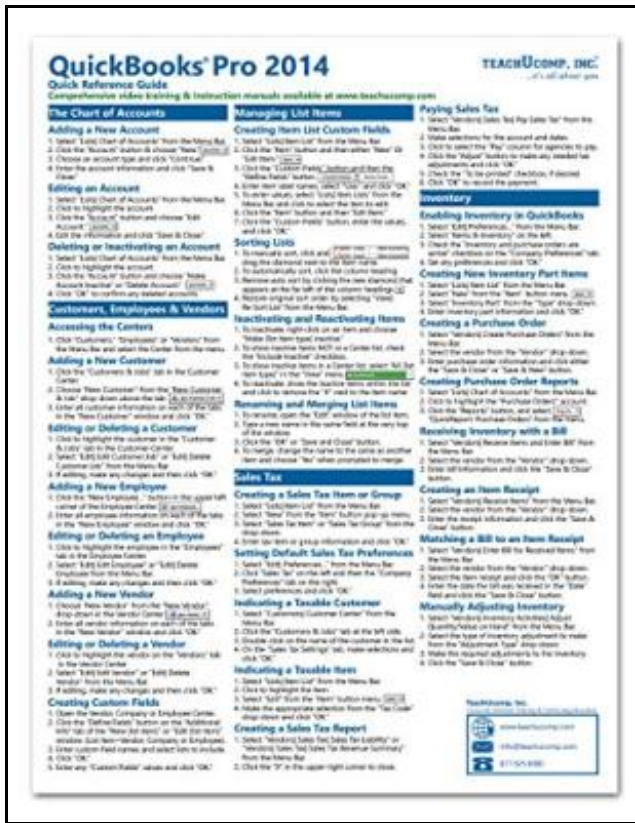
Filesize: 2.07 MB